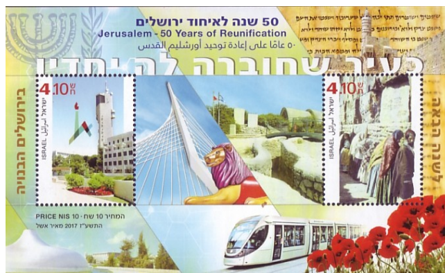
Jerusalem - 50 years of Reunification

The Shabbat Shiur is fifty minutes before Mincha.