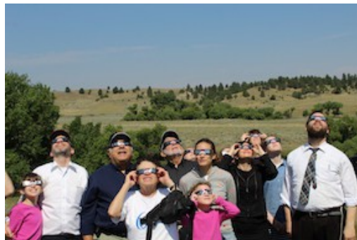
Watching the eclipse near Glendo, Wyoming. Visit edosdenver.org to see more pictures!

The Shabbat Shiur is fifty minutes before Mincha.